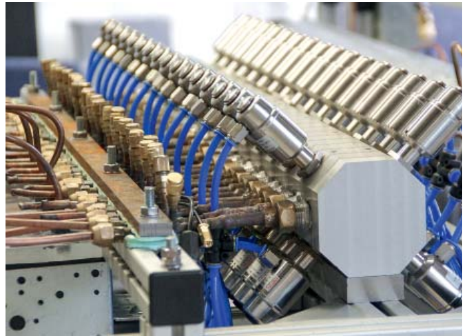
GEMÜ globe valve manifold with GEMÜ 9550 pneumatic actuators

Since the refrigerant used can warm up under the influence of ambient temperature, thereby increasing the pressure in the closed system, the multi-port valve is sealed up to 28 bar.