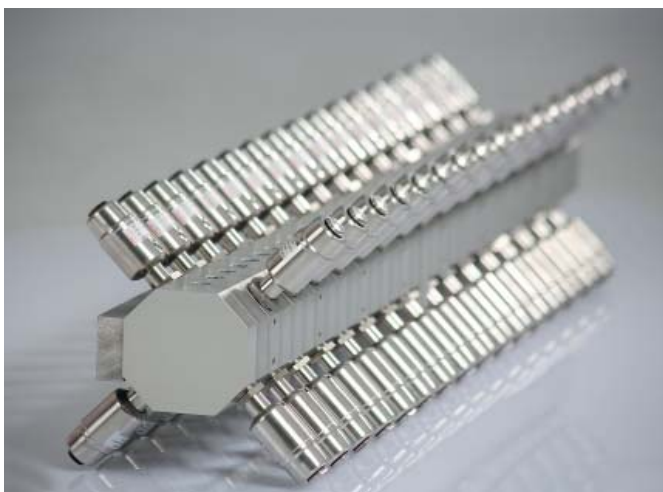
GEMÜ globe valve manifold with GEMÜ 9550 pneumatic actuators